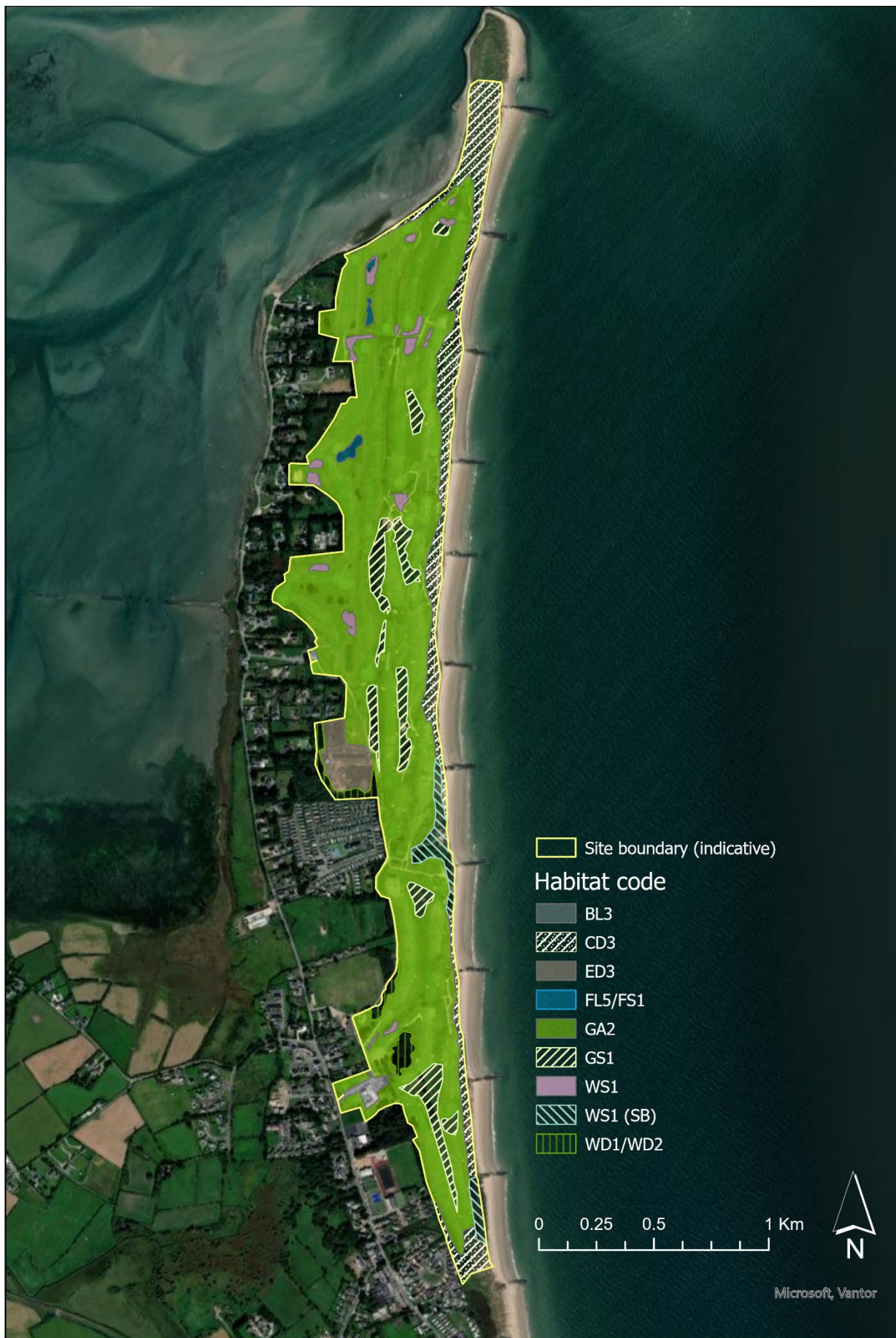
Figure 2 Habitat map