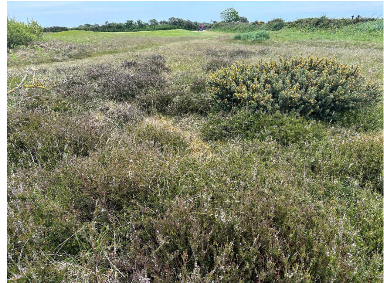
Figure 5 Candidate decalcified dune heath - requires detailed examination to map extent of this potentially valuable habitat type

There are several small wetlands on site, these are remnant dune slacks and feature well developed reedbeds. Given their location at the south east corner of the country, their role in attracting and supporting colonising Odonata species (dragonflies and damselflies) amongst other migratory invertebrates, which are spreading through climate change, is important and these could be of significance for biodiversity recording. Encouraging some access in suitable conditions by local volunteers for recording would be a contribution to national recording. Maintaining a vegetated fringe as a buffer to course activities and maintaining the reedbed and open water mosaic is important. While ‘cleaning’ is not essential, some rotational reed cutting or infrequent clear out may be of benefit.