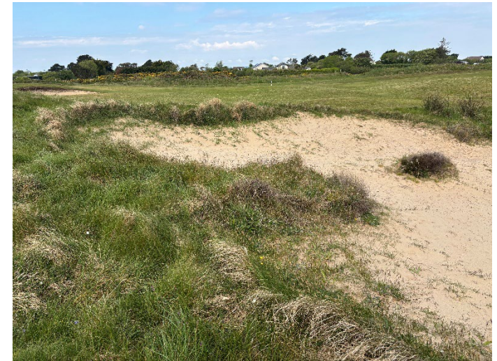
Figure 4 Sand scrapes have been created from over enriched areas and are restoring dune character to the course

The club has retained and actively managed sand scrape features across parts of the site, which are outside the SAC. These areas mimic natural dune dynamics and provide high-value habitat for dune specialist species, including invertebrates associated with bare sand. These are a strong example of best-practice dune management. There may be additional areas for consideration, notably where coarse grasses have taken hold in enriched soils.