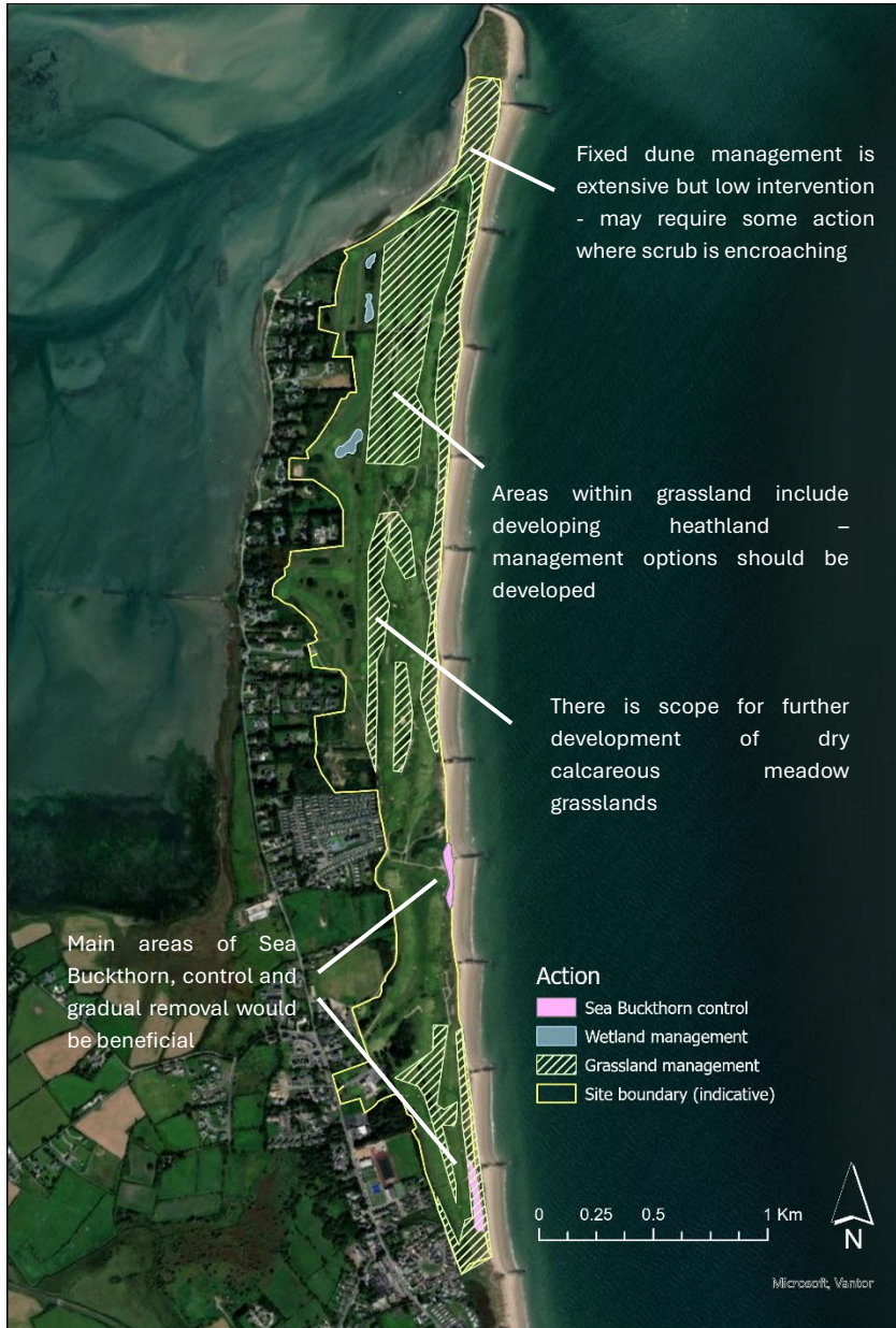
Figure 6 Indicative locations of main biodiversity recommended actions