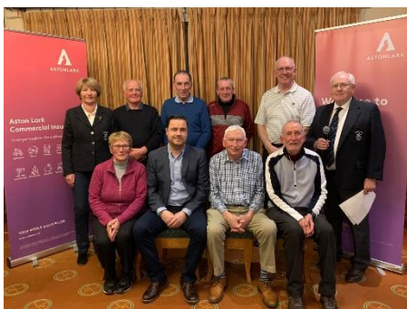
3rd Place Overall