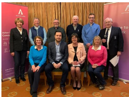
2nd Place Overall

All the winners in both categories were presented with their prizes after food in the Clubhouse on Sunday evening 13th March. Thanks to all participants (120 including subs) and all who contributed to an enjoyable Winter League 2022. You can see all the prize giving photos here.