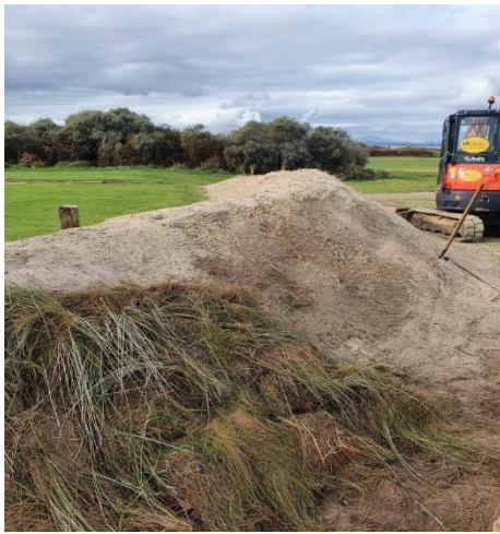
Construction of the new Marram bank at 8 th tee, the Old Course