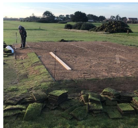
Prepping new tee platform on 12 th hole, the Burrow Links