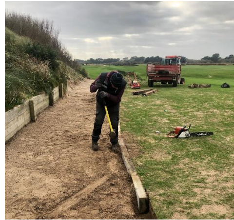
Installing the new pathway at 9 th tee, the Burrow Links