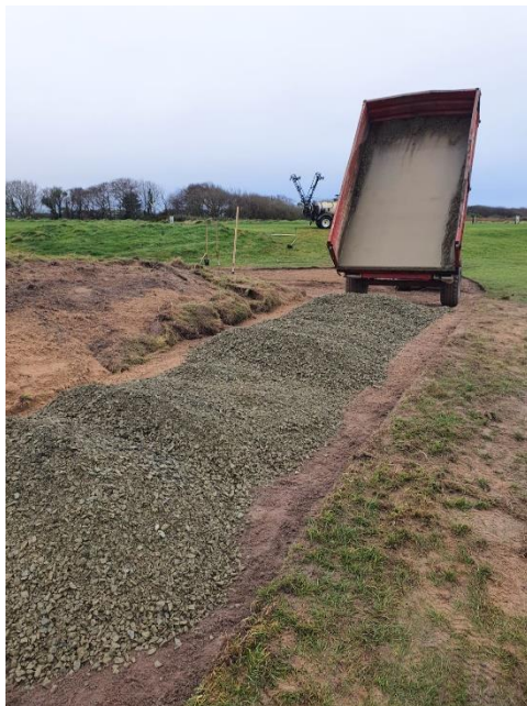
Construction of new pathway from 1 st green to 2 nd tee box, the Old Course