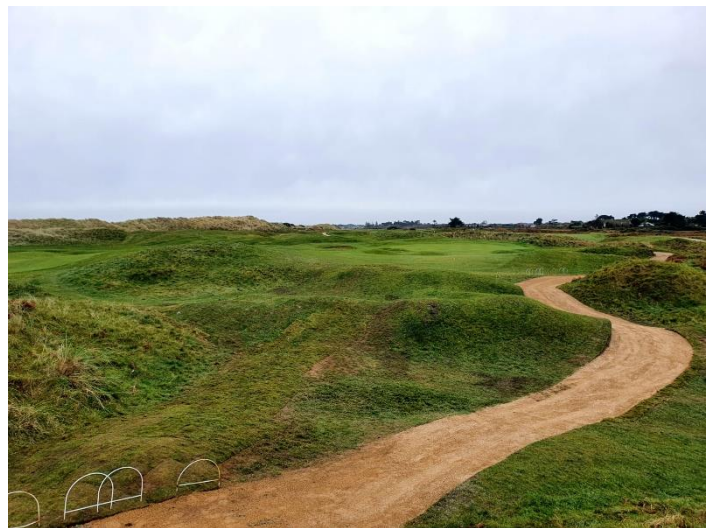
New pathway & mounding on 10 th hole, the Old Course